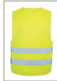
X217GXL (Back) Hi-Vis Yellow XL (Adults)