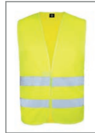
X217GXL (Front) Hi-Vis Yellow XL (Adults)

X217 = Industry, transport and logistics, events, security / KWG100 = Way to school, cycling, playing, hiking, sports