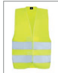
KWG100 (Front) Hi-Vis Yellow XS,S (Children)