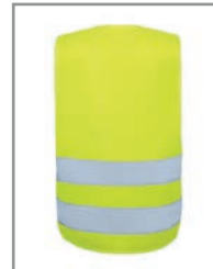
KWG100 (Back) Hi-Vis Yellow XS,S (Children)