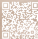
BG714 Velvet Accessory Bag