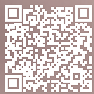
BG560 Small Training Holdall