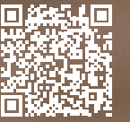
BG715 Velvet Accessory Pouch