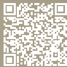
BG871 Simplicity Roll-Top Backpack Lite